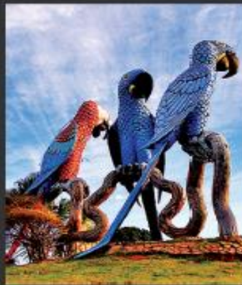
PRAÇA DAS ARARAS