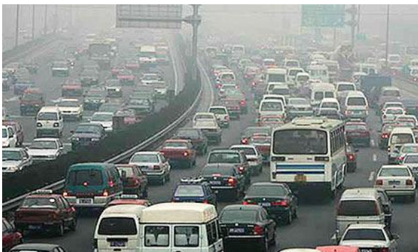
Taken from Google Images