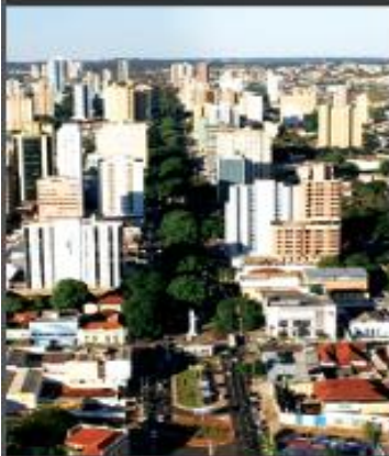
CAMPO GRANDE - MS

INTERNATIONAL COURSE OF SCIENTIFIC INITIATION ON CARDIOVASCULAR SCIENCES - 30 Hours