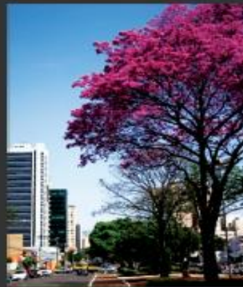
IPÊ - AV. AFONSO PENA