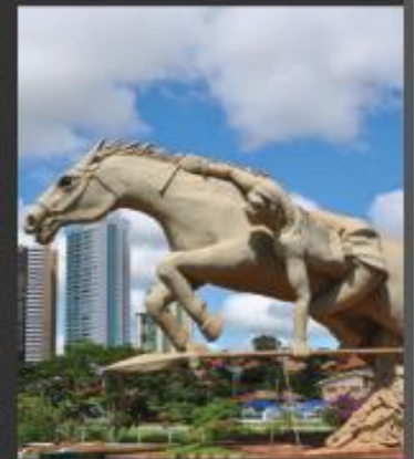
PARQUE DAS NAÇÕES INDÍGENAS